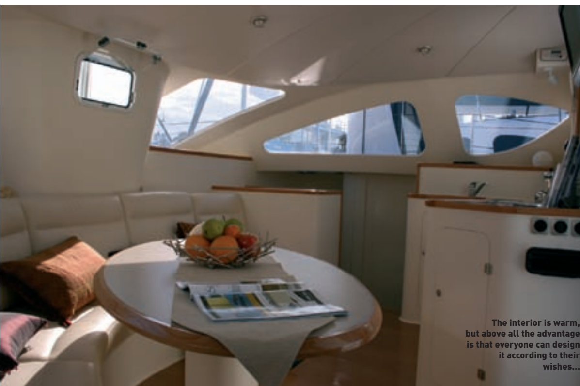
The interior is warm, but above all the advantage is that everyone can design it according to their wishes...