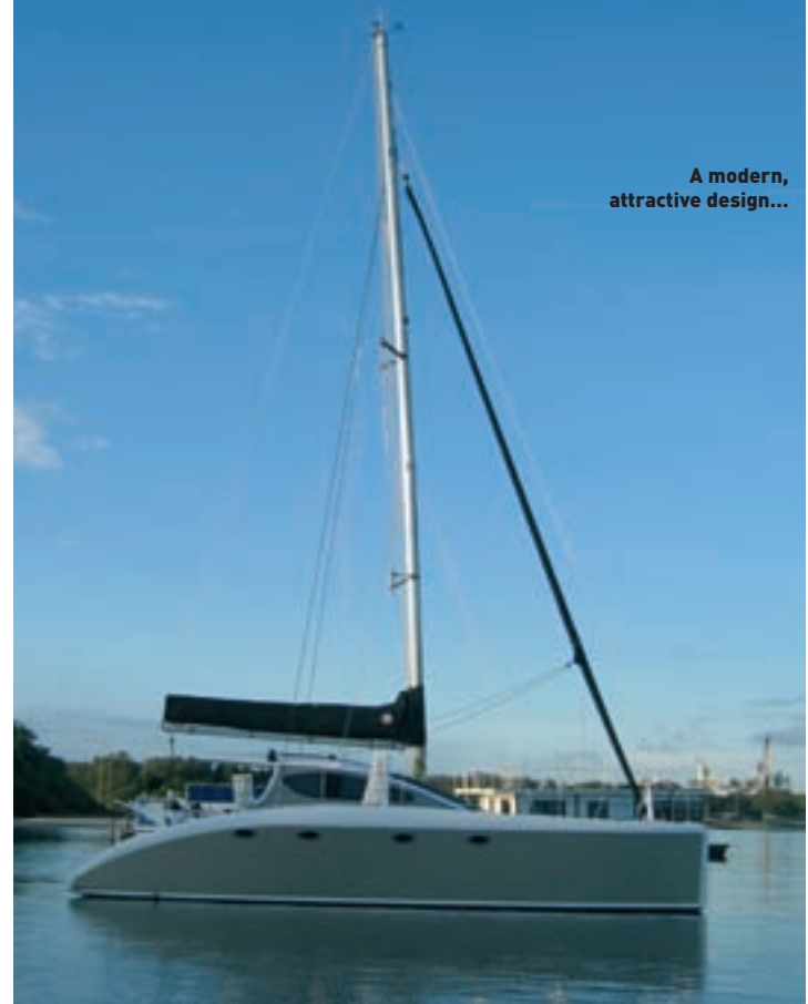
A modern, attractive design...

to access the aft steps which are spacious and close to the water. The composite cabin roof extends over the cockpit area supplying generous cover and protection from the elements. This is noticeable when night sailing as well, with a good indoor/outdoor environment where the crew are always dry and warm. Spirited One had a custom built storage locker for the fold up cockpit table. This worked well, with the table easily set up when moored but while sailing the table is out of the way. A distinct advantage of assembling a kit-set boat is the flexibility when it comes to customizing areas to suit personal tastes.